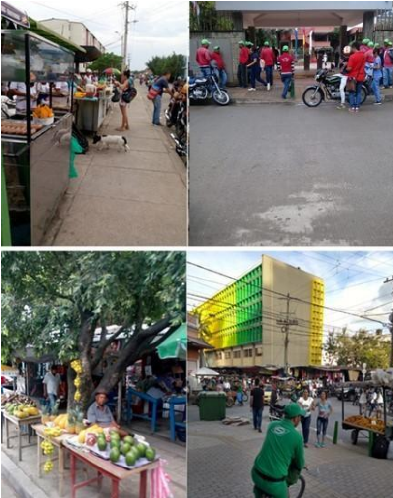
Figure 1. Informal economy on the roads and platforms of Montería.

As can be seen in figure 1, stationary and semi-stationary merchants occupy not only the environment of institutions and companies located in the center of the city, but also platforms and roads in residential sectors that have achieved a strong commercial dynamic, based on the informality. Likewise, the presence of street vendors and motorcycle taxi drivers is evident, who circulate and park their carts or motorcycles on the most important roads, affecting the traffic of automobiles and public transport buses.